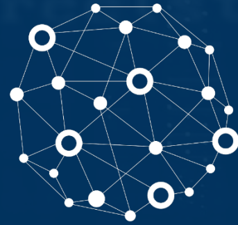
Government to Citizen Model (G2C)